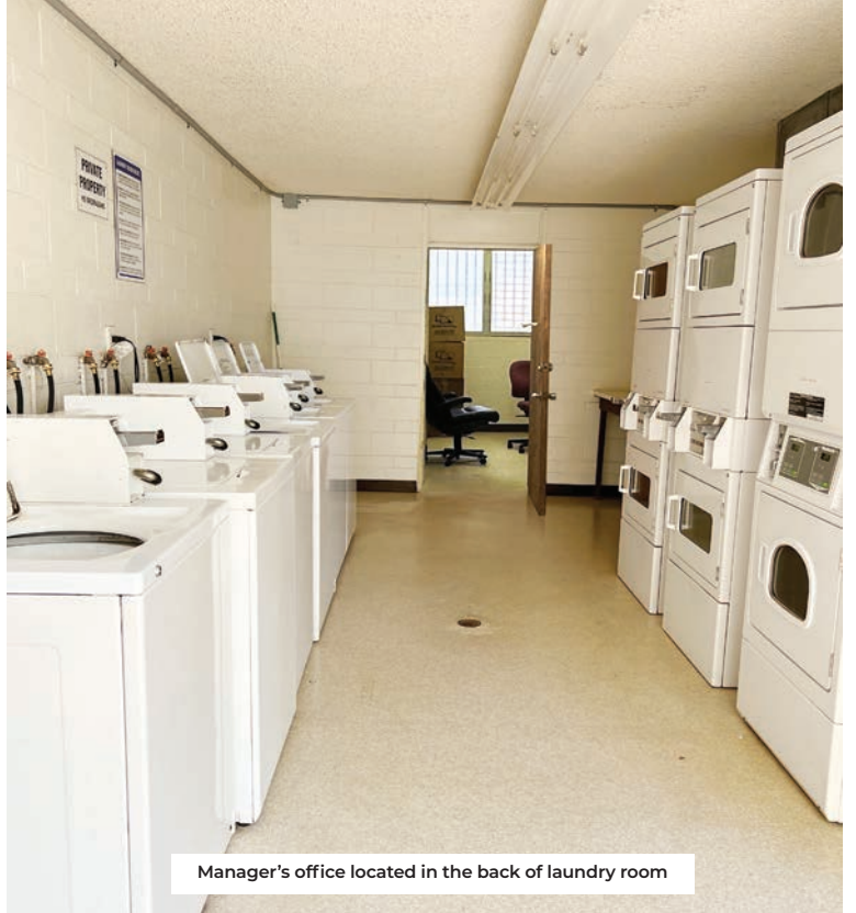
Manager's office located in the back of laundry room